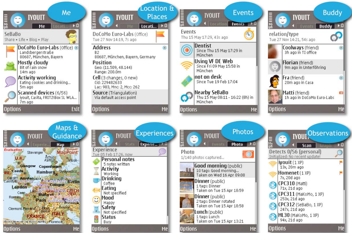
Figure 1: Overview of the IYOUIT mobile client.